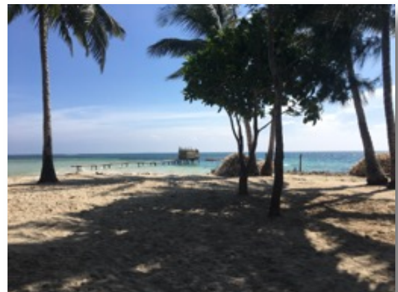
Men's toilet over the sea

Toilets- some drop-toilets in the village, whilst others have to do their "pek-pek poo" in the sea, & also wash their clothes & themselves in the sea????!!!!